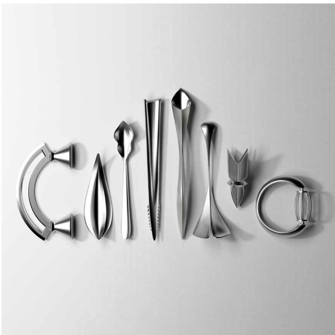
Cillio Cheese Utensils