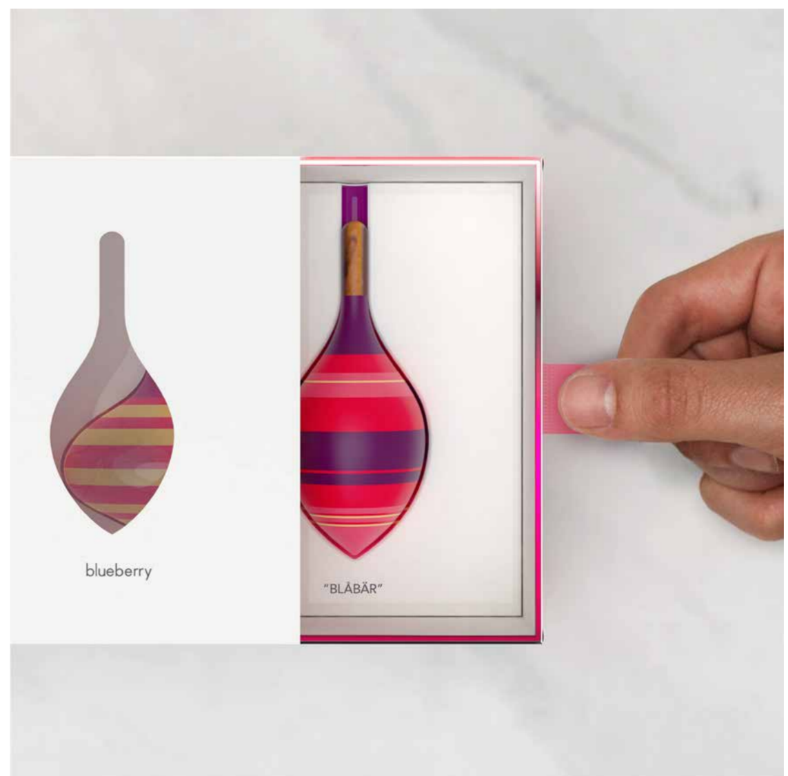
Chocotop Collectible Chocolate