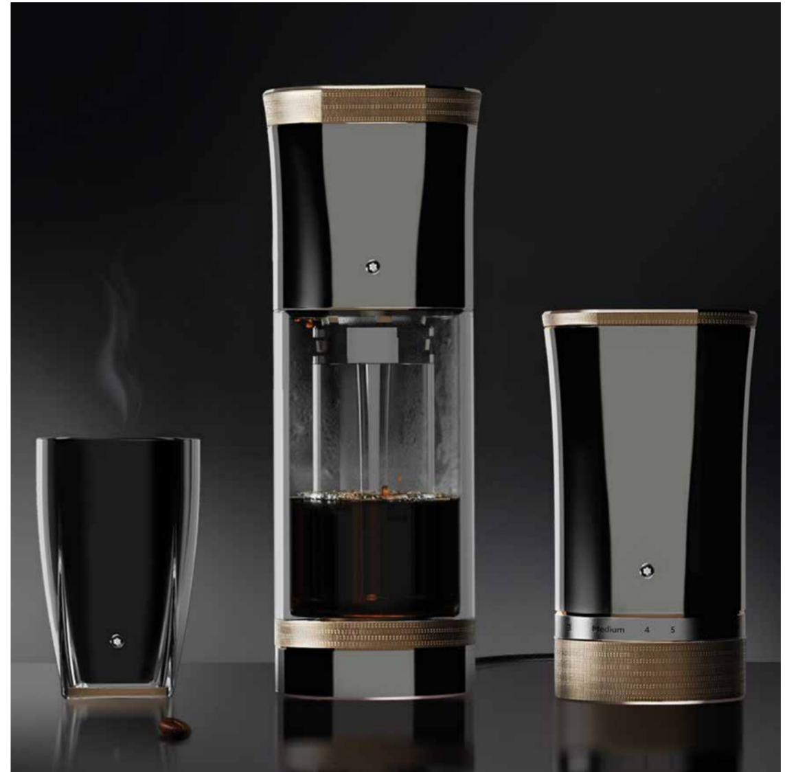
Montblanc Coffee Set

https://www.simpodesign.com/shinolaelves